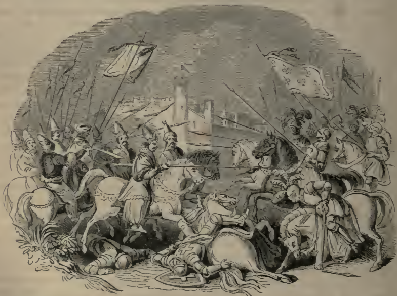
BATTLE OF NICOPOLI. Designed from Contemporary MSS.; an oriental MS. Hist. of Tamerlane furnishing the Costume of the Turks.